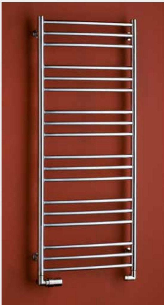
LAVENO - brushed stainless 500 × 1210 mm