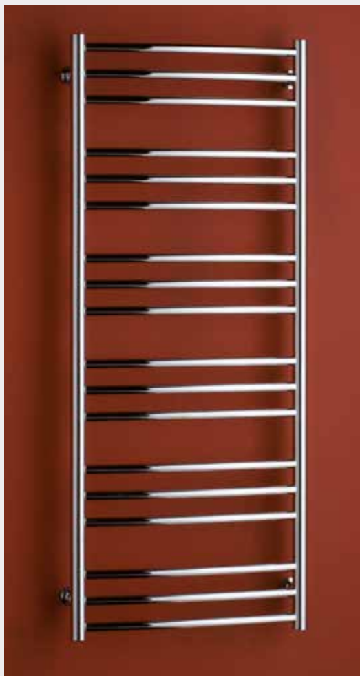
LAVENO - chrome 600 × 1210 mm