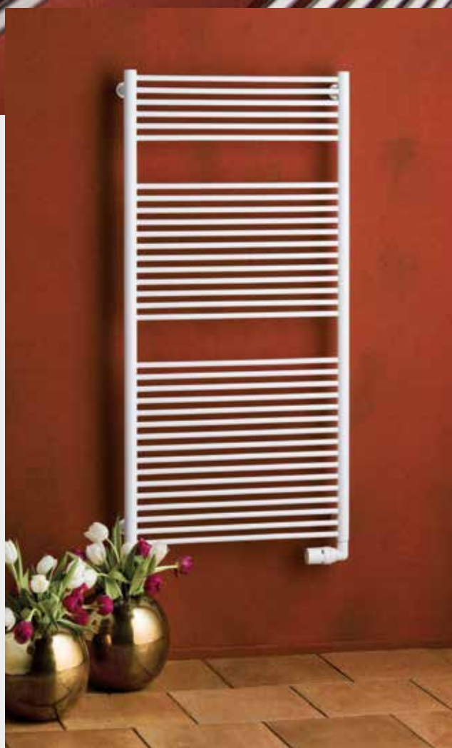
TAIFUN - white coated 600 × 1210 mm