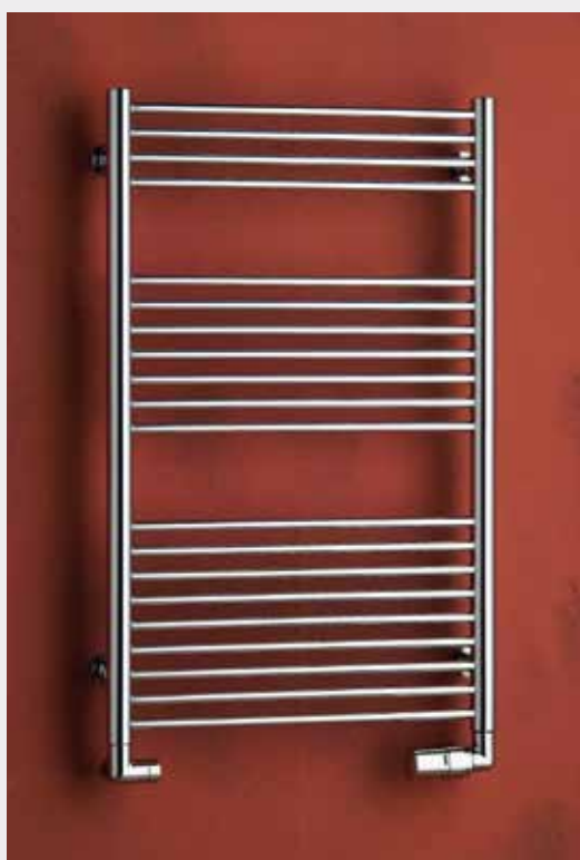
TAIFUN - chrome 500 × 790 mm