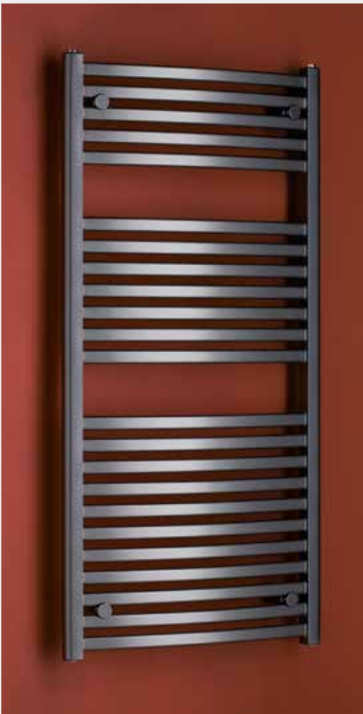
MARABU - anthracite coated 600 × 1233 mm