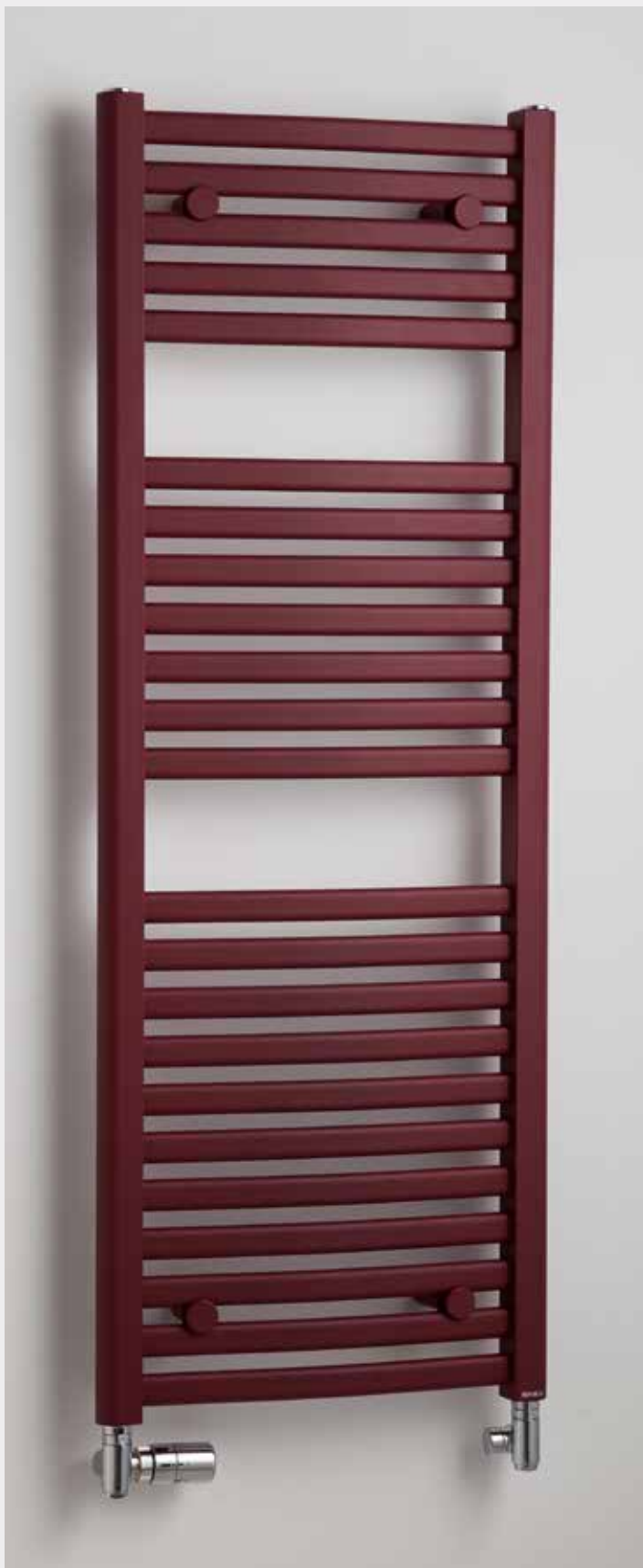
MARABU - claret coated - structural colour 450 x 1233 mm