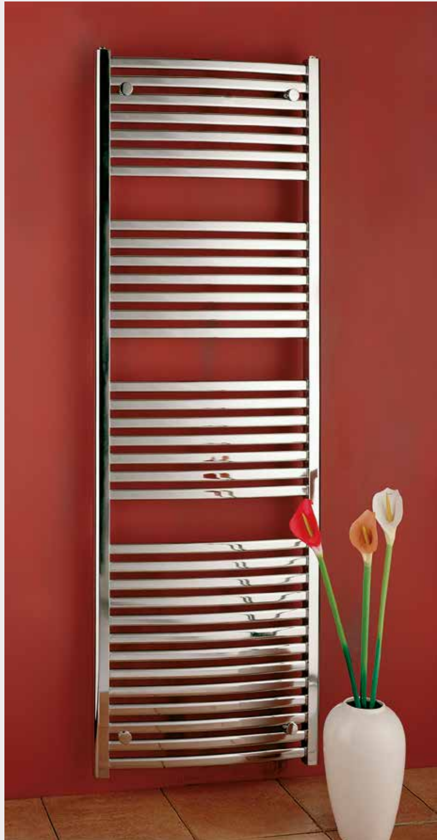
MARABU - chrome 600 × 1815 mm