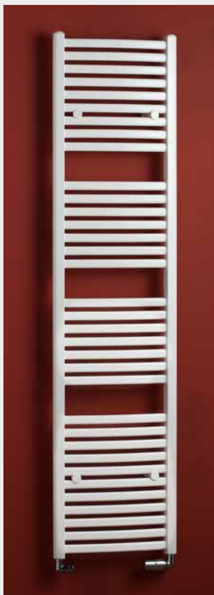
MARABU - white coated 450 x 1815 mm